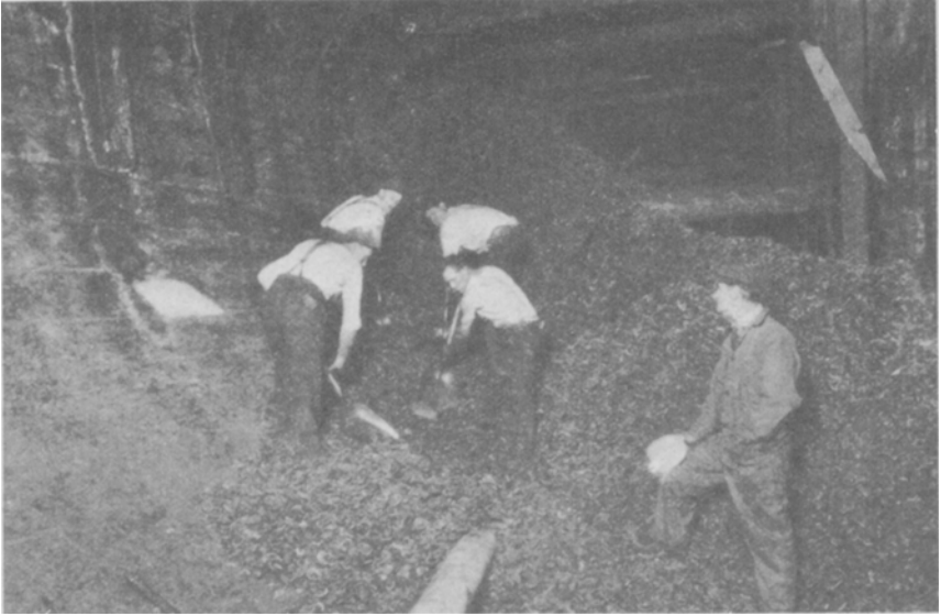
Intake at mouth of pneumatic tube. Samples drawn near that point

average box car holds about 112 buckets, the entire shipment would represent about 3360 buckets. The scoop used for taking the sample is intended to hold sufficient material to permit a fair average being represented, and by this means about one and a half pounds is taken from each bucket. As every eighth sling was sampled, it in turn represented about 420 buckets, from each of which about one and a half pounds of copra was removed, or a total of about 630 pounds to represent the shipment as a whole.