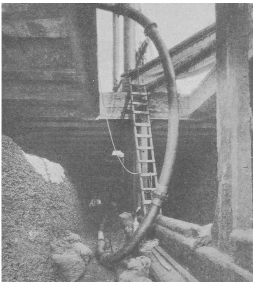
Two wings of copra boat with pneumatic system installed ready for discharge

Rule No. 560, as well as the uniform copra contract, requires that samples be drawn "from at least every tenth sling load as discharged from the vessel," which is none too much where such large tonnage is involved. Let us see how this procedure works out in practice, taking for example a concrete case, where some 1050 long tons of copra were loaded into 30 cars and every eighth bucket sampled. As the